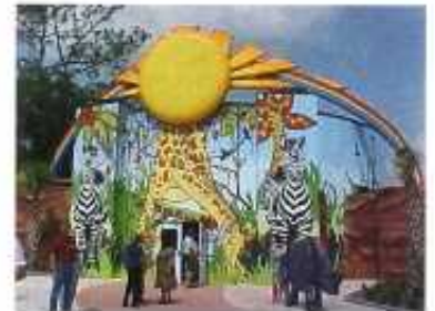
The movie theatre is one of many highlights at "Give Kids the World"

like it just as well as Disney. Wishes Can Happen works closely with "Give Kids the World" to insure that every child's visit to Florida is truly a memorable one!