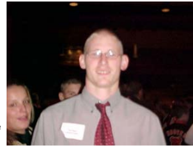
"I've thought of a wish . . . Can you make Hugh Heffner my best friend???"

but our policy is no motorized vehicles due to liability.